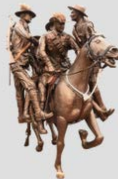
Bronze Bill the Bastard